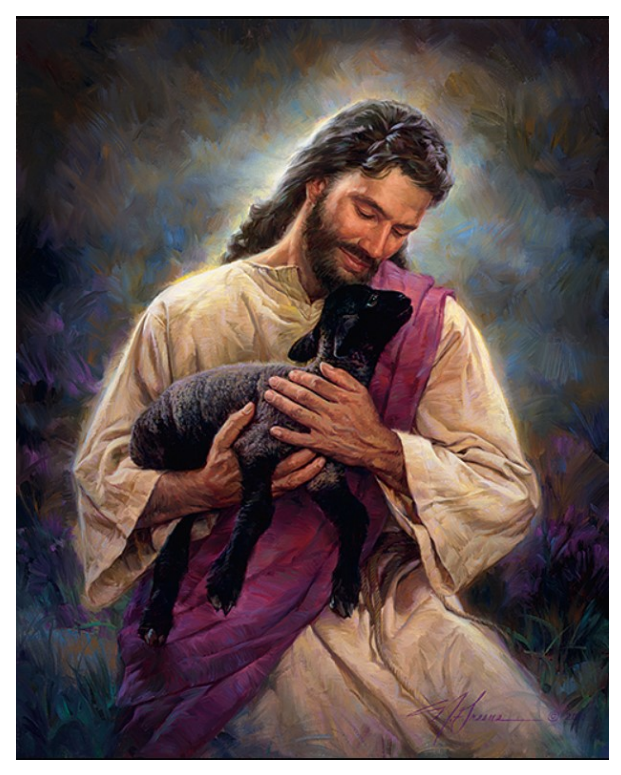
The Lamb of God